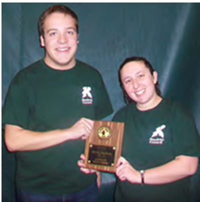
KINNELON HS Spirit Donations