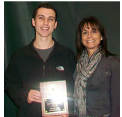
SENECA HS Spirit of the Holidays Week