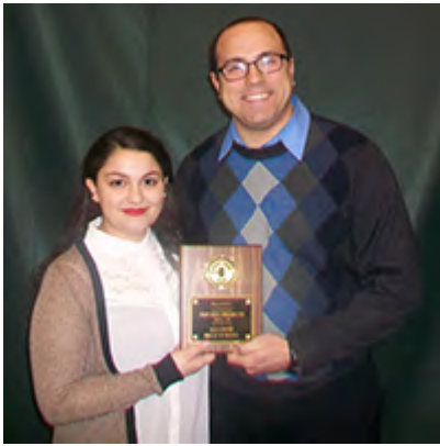
BAYONNE HS The Sandy Ground