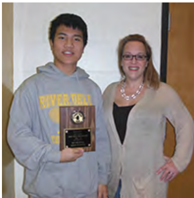
RIVER DELL HS R.D. Mobile App