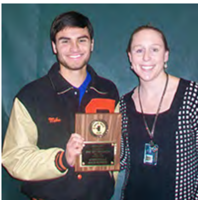
SOMERVILLE HS The Spirit Tree