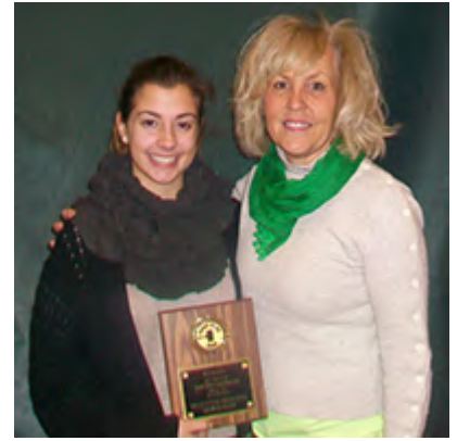
HIGH POINT REGIONAL HS The Ryan Burbank Project