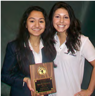
RANDOLPH HS Timeline of Tees