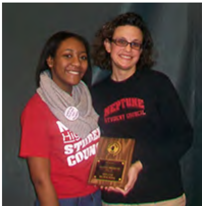
NEPTUNE HS PTA Babysitting & Comm. Events