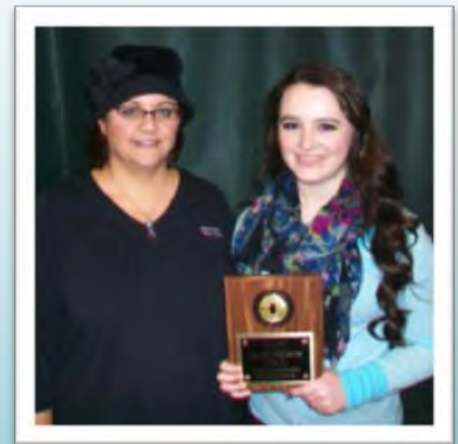
Williamstown High School HAUNTED HIGH SCHOOL

Visit www.njasc.org/awards/topten for more information.