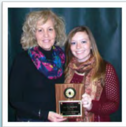
High Point Regional High School RED CROSS PROJECT