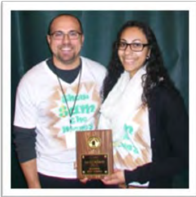
Bayonne High School REWRITING THE SCHOOL CONSTITUTION

The Top Ten Projects award goes out to 10 (sometimes more!) schools every year for their notable projects or activities that are conducted at their schools.