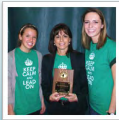
Seneca High School SPIRIT CARNIVAL