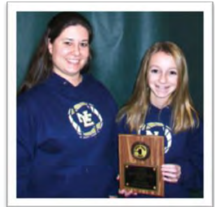
New Egypt Middle School HOLIDAY TOY DRIVE