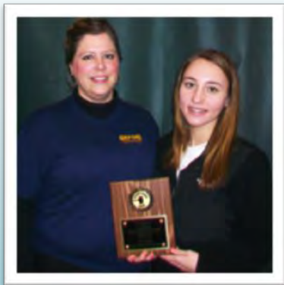
Oxford Central School DUCK RACE