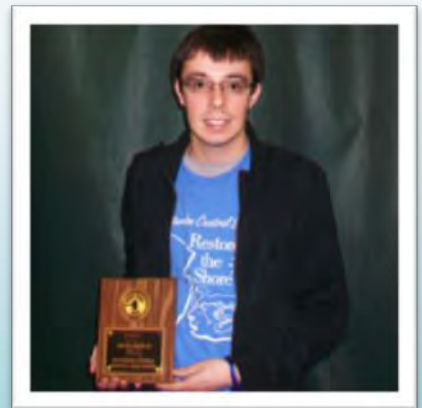
Hunterdon Central Regional High School RESTORE THE SHORE BENEFIT CONCERT

Visit www.njasc.org/awards/topten for more information.