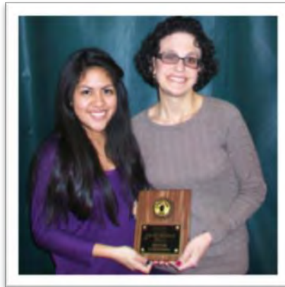
Neptune High School FLIERS FIGHTING CANCER