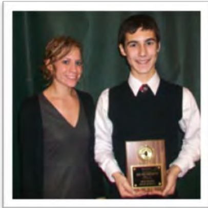
Belvidere High School SLIME THE TEACHER