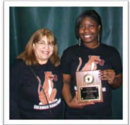
Columbia High School THE JIMMY FUND