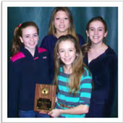
Madison Junior School ECLC STUDENT EXCHANGE PROGRAM

The Top Ten Projects award goes out to 10 (sometimes more!) schools every year for their notable projects or activities that are conducted at their schools.